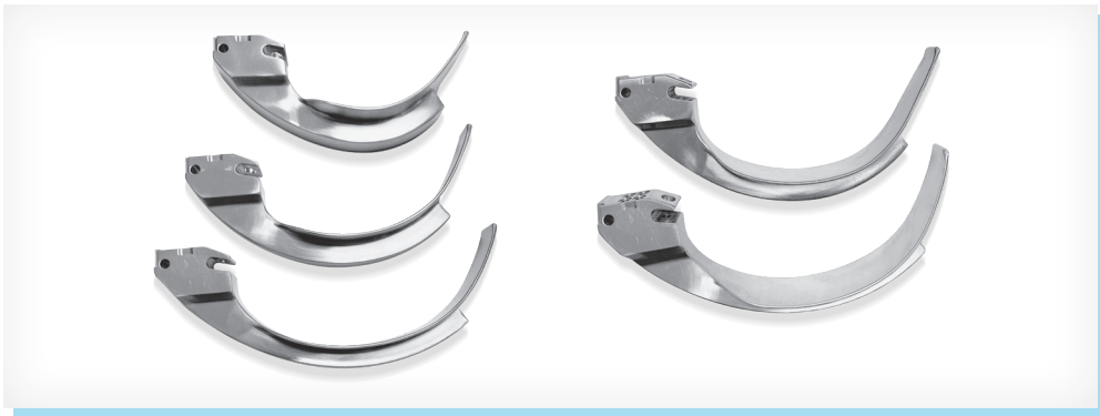
Optional Curved Mac "D" Blades Sizes 1,2,3,4,5