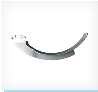
and Mac 5.