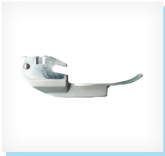
Optional blade sizes available are: Miller 0